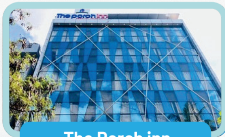
The Porch inn